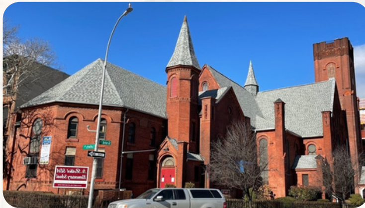
The Church of our Father's purchased by The Nazarene Congregational Church.