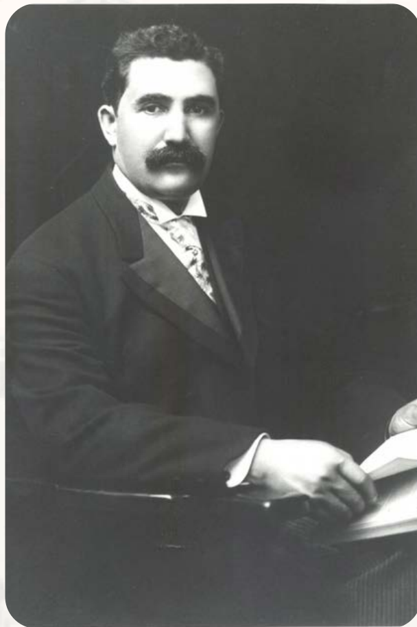
Reverend Jesse Moorland