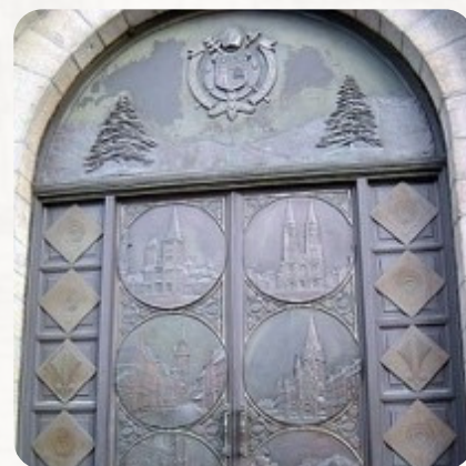
Interior and Bronze Doors of Our Lady of Lebanon Cathedral